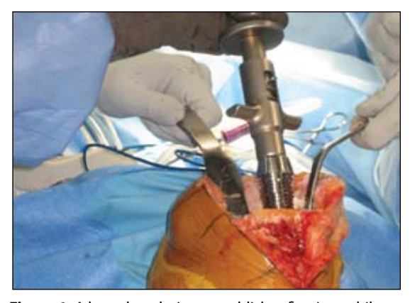
Figure 1: A broach technique establishes fixation, while a Morse taper bonds the implant to the sleeve.

He also noted that 15 patients (28%) required reoperation for any reason. However, only four patients required sleeve removal, two for infection and two for aseptic failures.